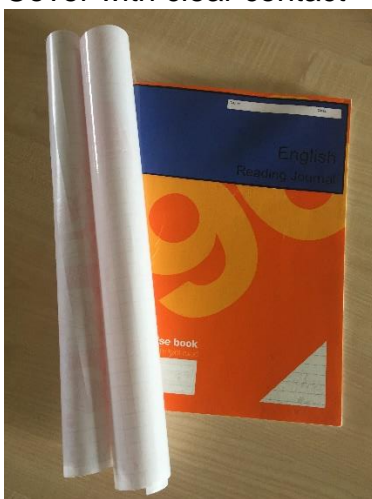
Cover with clear contact