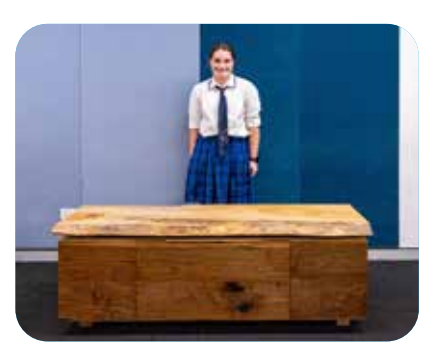
SHAPE - Industrial Technology Abbey S